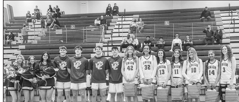
The Union County Lady Panther seniors depart Friday's win over Rockmart to an ovation from the home crowd.